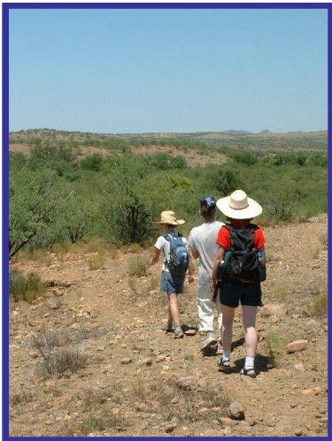
MPT team members at the U.S./Mexico Border.

MPT has worked in solidarity with the people of Iraq, Haiti, Bosnia, Mexico, and along the U.S./Mexico border. We are currently fielding international teams to Palestine/Israel. At the invitation of the local community, we also place domestic peace teams at regional events (i.e., within the US borders) such as hate group rallies, death row executions, and Gay Pride Day parades.