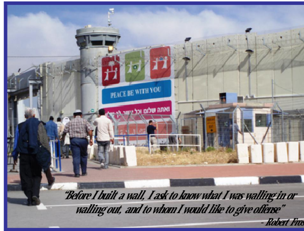
Apartheid Wall—the entrance to Bethlehem

Muertes , and the International Solidarity Movement (ISM) . We are proud to be an active member of Nonviolent Peaceforce .